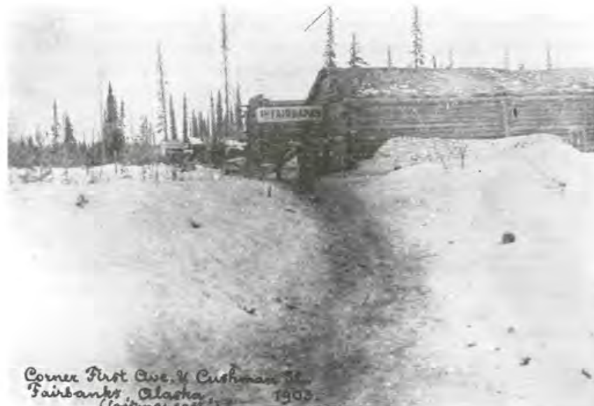
Corner First Ave. & Cushman St. Fairbanks, Alaska 1903