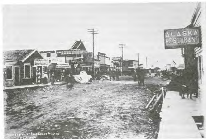
First Street, Fairbanks — 1904